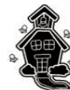
Middle School 3